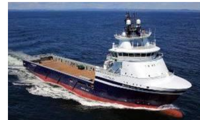
Island Chieftain – c/s LALR BP – Sandnessjøen