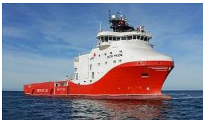
Siem Pride c/s LDPH AS Norske Shell – Kristiansund