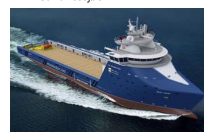
Stril Luna – c/s LEHE Statoil – Kristiansund