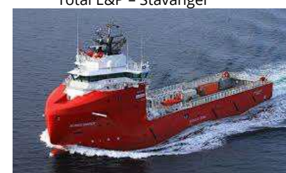
Skandi Kvitsøy – c/s LDCJ ConocoPhillips – Stavanger