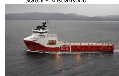
Siem Symphony – c/s LCHK Total E&P – Stavanger