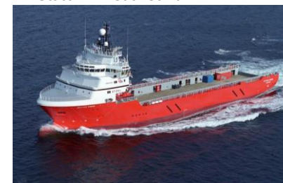
Energy Swan – c/s LFUR Wintershall – Mongstad