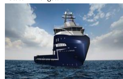
Troms Arcurus – c/s LKNL Statoil - Kristiansund