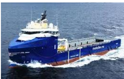
Stril Orion c/s 3YUU Det Norske