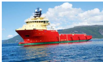
Torsborg – c/s oz2130 BG – Kristiansund