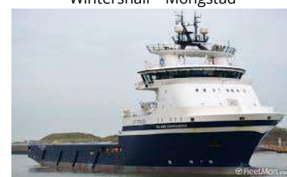
Island Commander – c/s LALW Lundin - Stavanger