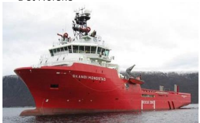
Skandi Mongstad – c/s LALP Statoil – Mongstad