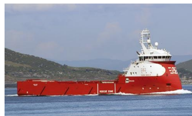
Rem Hrist c/s LGCK Statoil - Mongstad