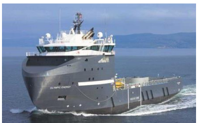
Olympic Energy – c/s 3YWS Statoil – Kristiansund